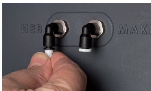
Figure 2 - Gas line 70-803-0911 shown as example

For Elegra models with instrument-specific gas connector: Now push the gas connector directly into the nebulizer gas port on the spectrometer. (Figure 2)